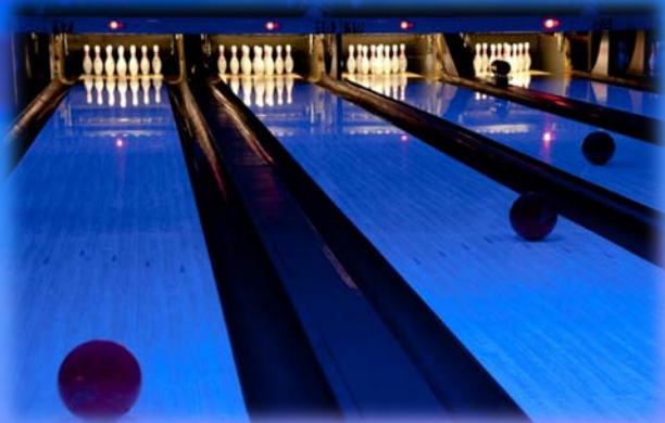
Upper Level Lane: Danforth Suite